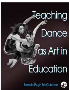
"Teaching Dance as Art in Education"

Transform teaching with a dynamic, hands-on, dance teacher workshop. Brenda Pugh McCutchen's inspiring sessions show how to make the most of numerous prompts that engage creative and critical thinking in dance to increase literacy and mastery of complex concepts. Teachers leave exhilarated, ready to get into the classroom armed with the dynamic inquiry-based teaching ideas.